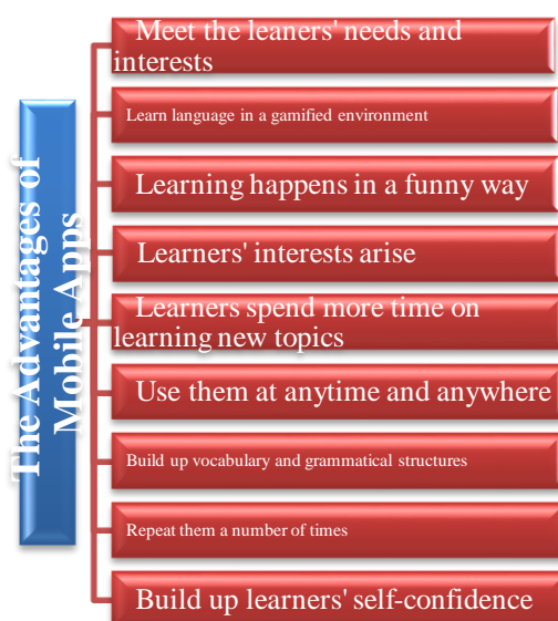
Fig: The Advantages that the EFL/ESL learners get from Mobile Apps

One more useful and interactive app that is designed for the learners to improve their grammar is Learn English grammar (UK ed.). This is an excellent app to learn the English language that covers 12 topics on grammar and each topic with 20 activities that cater the needs of all the learners of the English language.